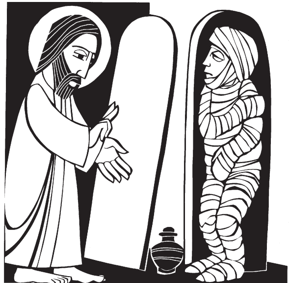
Faith Formation for Life

31 Sat The Easter Vigil in the Holy Night, 8:00 p.m. 30 Fri Celebration of The Lord's Passion, 7:00 p.m. Collection for The Holy Land Parish Office Closed 29 Thu Mass of The Lord's Supper, 7:00 p.m. Collection for Sister Parish in Haiti Parish Office Closes at Noon The Lord's Table, 1:00 p.m.-5:00 p.m. 28 Wed Confessions, 6:30-8:00 p.m., Church 27 Tue Scripture Study, 10:00 a.m., Barn No Faith Formation Sessions 25 Sun Passion Sunday Church School, 9:00 a.m. in Church Procession, 9:00 a.m. No Faith Formation Sessions 23 Fri Stations of the Cross, 7:00 p.m., Church Lenten Discussion, 7:30 p.m., Founders Hall 22 Thu Sodality Rosary, 7:00 p.m., Barn 21 Wed Confessions, 6:30-8:00 p.m., Church 20 Tue Scripture Study, 10:00 a.m., Barn Faith Formation: Grades K-5, 4:45 p.m., Founders Hall 19 Mon 40 Hours Ends at 9:15 a.m. Liturgy, Barn 18 Sun 40 Hours, St. Thomas More Chapel, Barn Head Start Bags Returned Church School, 9:00 a.m. Sodality, 9:00 a.m. Mass and Meeting Faith Formation: Grades 6, 7, 8, 6:30 p.m., Founders Hall