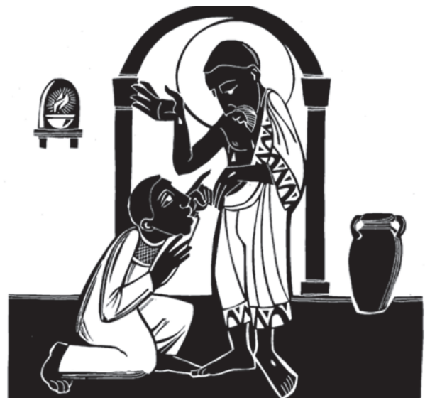
Faith Formation for Life

29 Sun Church School, 9:00 a.m. St. Martin Food Bags Collected Faith Formation: Grades 6, 7, 8: 6:30 p.m., Founders Hall 24 Tue Scripture Study, 10:00 a.m., Barn Faith Formation: Grades K-5: 4:45 p.m., Founders Hall 22 Sun Church School, 9:00 a.m. Adopted Family Collection St. Martin Food Bags Distributed Knights of Columbus Hershey Park Family Fun Day, 10:00 a.m.—6:00 p.m. Faith Formation: Grades 6, 7, 8: 6:30 p.m., Founders Hall 21 Sat Baptism Class, 10:00 a.m., Barn 17 Tue Scripture Study, 10:00 a.m., Barn Faith Formation: Grades K-5: 4:45 p.m., Founders Hall 15 Sun Church School, 9:00 a.m. Sodality, 9:00 a.m. Mass and Meeting Faith Formation: Grades 6, 7, 8: 6:30 p.m., Founders Hall 10 Tue Scripture Study, 10:00 a.m., Barn Faith Formation: Grades K-5: 4:45 p.m., Founders Hall 09 Mon Sodality Rosary, 7:00 p.m., Barn 08 Sun Mortgage Collection Church School, 9:00 a.m. Men's Club, 11:00 a.m. Mass Noon, Annual Brunch, Nantucket Reef Faith Formation: Grades 6, 7, 8: 6:30 p.m., Founders Hall